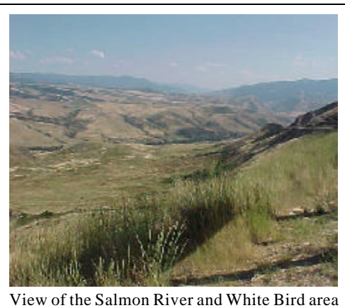
from near the location of the Halfway House on the summit of White Bird Hill. Photo by Shannon Conder, 1999

The original dirt road from White Bird to Grangeville wandered up the steep slope in a series of switchbacks and passed directly in front of the Rape homestead. Even in fair weather, the eleven-mile trek to the crest was treacherous and exhausting for teams of freighters hauling goods to nearby settlements. Just reaching the top could take the better part of a day. It was not long before the Rape family discovered the advantage of operating a rest stop. The Halfway House, so named because of its location halfway between Grangeville and White Bird, provided fresh teams, food and lodging for the weary travelers.