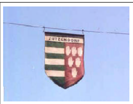
Zutzendorf's Coat of Arms

Primary education began in the late 1600s in Zutzendorf as a function of the Lutheran Church there. Its not known exactly what subjects were taught except for writing and possibly reading. Alsace was way ahead of most of Europe concerning education for the common people. The diagram of Reeb-Reb signatures dates back to the late 1600s and was traced from church book records. A number of years before the revolution, primary education became managed by the village council wherein they employed a school